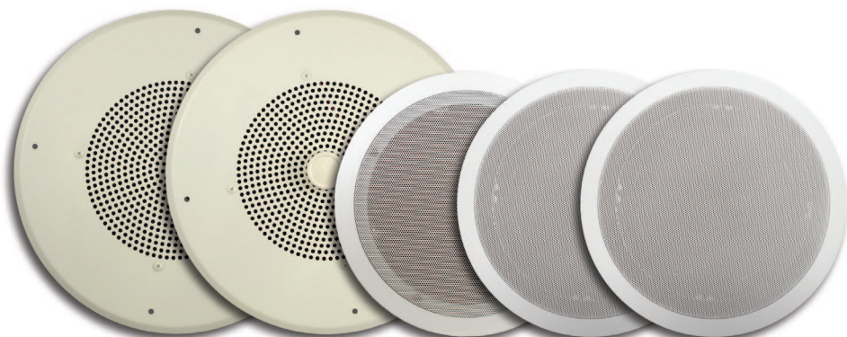
30AE DOD 498