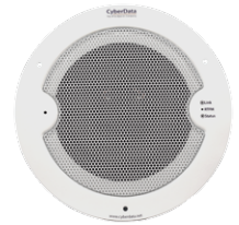
011396 InformaCast® Enabled Speaker