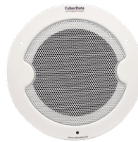
011121 Auxiliary Analog Speaker