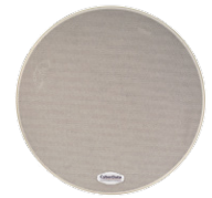
011588 Analog Ceiling Speaker 25V/70V/8 Ohm