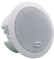
011458 Multicast Ceiling Speaker