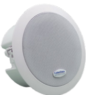
011511 VoIP SIP/Multicast Ceiling Mount Speaker