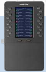
Expansion Module PM200