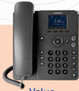
Value Models P310 & P315