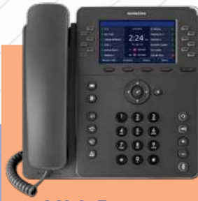
Mid-Range Models P320, P325, P330