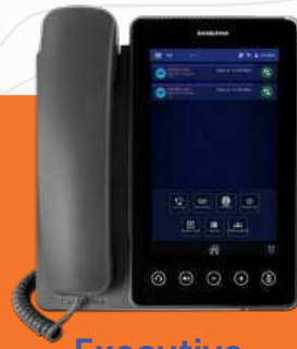
Executive Model P370