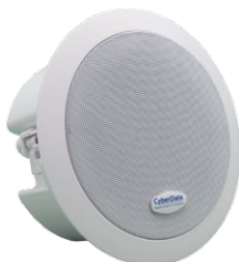
011511 VoIP SIP/Multicast Ceiling Mount Speaker