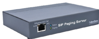
011146 SIP Paging Server with Bell Scheduler