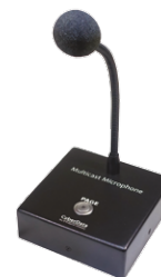
011446 Multicast VoIP Microphone