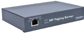
011146 SIP Paging Server with Bell Scheduler