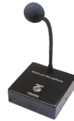
011446 Multicast VoIP Microphone