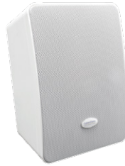
011512 VoIP SIP/Multicast Wall Mount Speaker