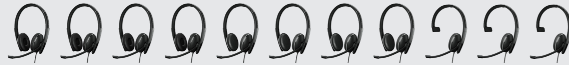
ADAPT 160T ANC USB, ADAPT 160 ANC USB, ADAPT 160T ANC USB-C, ADAPT 160 ANC USB-C, ADAPT 165T USB II, ADAPT 165T USB-C II, ADAPT 165 USB II, ADAPT 165 USB-C II, ADAPT 135T USB II, ADAPT 135T USB-C II, ADAPT 135 USB II