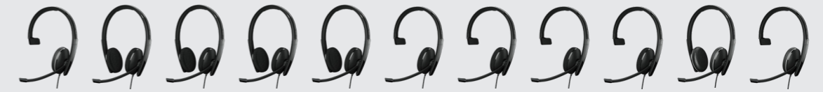
ADAPT 135 USB-C II, ADAPT 160T USB II, ADAPT 160T USB-C II, ADAPT 160 USB II, ADAPT 160 USB-C II, ADAPT 130T USB II, ADAPT 130T USB-C II, ADAPT 130 USB II, ADAPT 130 USB-C II, ADAPT 165 II, ADAPT 135 II