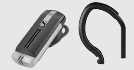
ADAPT Presence Grey Business