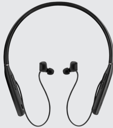
ADAPT 400 Series In-ear neckband headset Wireless Bluetooth®