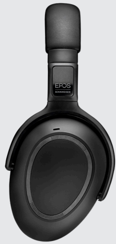
ADAPT 600 Series Over-ear, headset Wireless Bluetooth®