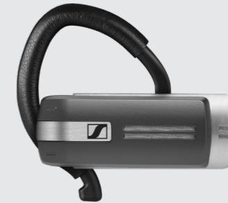
ADAPT Presence Series In-ear headset Wireless Bluetooth®