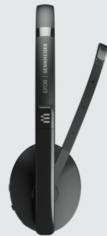
ADAPT 200 Series On-ear, single-sided and double-sided, headset Wireless Bluetooth®