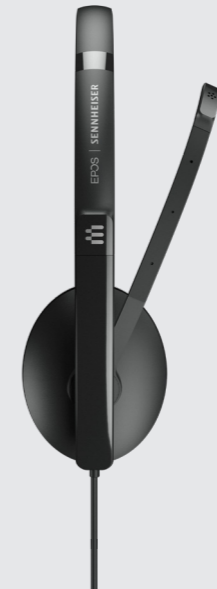
ADAPT 100 Series On-ear, single-sided and double-sided wired headset