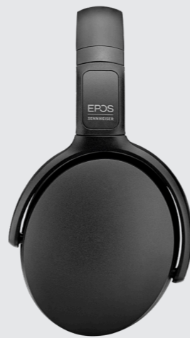
ADAPT 300 Series Over-ear, headset Wireless Bluetooth®