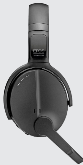
ADAPT 500 Series On-ear, headset Wireless Bluetooth®