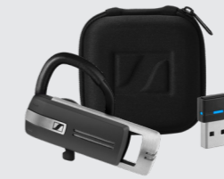
ADAPT Presence Grey UC