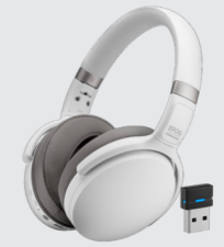
ADAPT 360 white