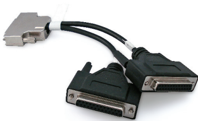
Dual Serial DB25 Octopus Cable Included.