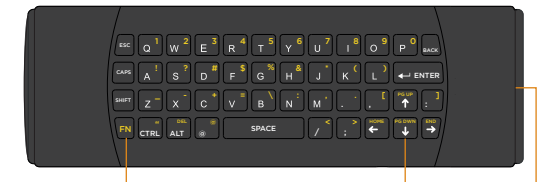
Function key (enables/disables yellow digits / symbols)