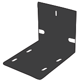
Wall mount 4 screws 4 x 40mm 4 plug 6 x 40mm 1 tripod UNC screw