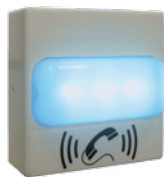
011288 Auxiliary RGB Strobe Kit