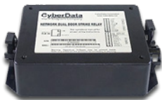
011375 Network Dual Door Strike Relay