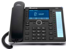
445HD IP Phone