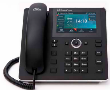
450HD IP Phone

The AudioCodes 400HD series of IP phones includes a range of easy-to-use, feature-rich products for the service provider hosted services, enterprise IP telephony and contact center markets. Based on the same advanced, field-proven underlying technology as our other VoIP products, AudioCodes high quality IP phones enable service providers, systems integrators and end-customers to build end-to-end VoIP solutions.