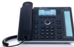
440HD IP Phone