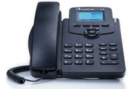
405HD IP Phone