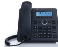
420HD IP Phone