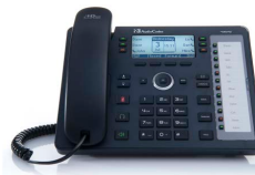
430HD IP Phone