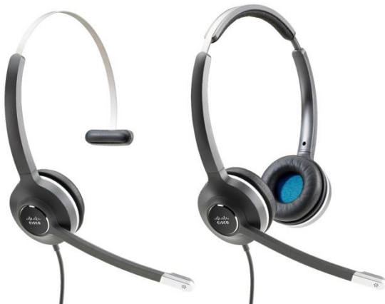
Figure 1. Cisco Headset 500 Series