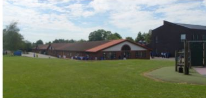
The Frederick Bird School, Now