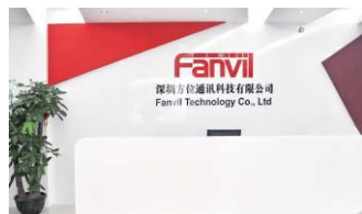
▲ Shenzhen corp