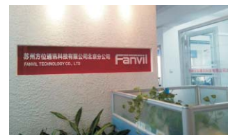
▲ Suzhou branch