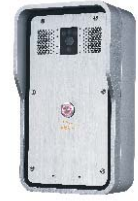
i20S Audio Door Phone