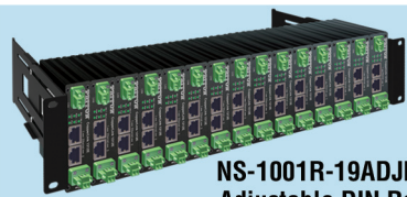
NS-1001R-19ADJDIN Adjustable DIN Rack